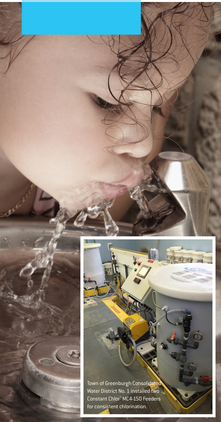
Town of Greenburgh Consolidated Water District No. 1 installed two Constant Chlor ® MC4-150 Feeders for consistent chlorination.

With a natural pH of approximately 7.2, drinking water from the City of New York has been called the “champagne” of drinking water. Some claim it’s the secret behind the unique taste and qualities of New York’s famous bagels and locally brewed beer. In fact, the water comes from the largest unfiltered water supply in the U.S., which draws from a network of 19 reservoirs within a 2,000-square-mile watershed. This expanse extends 125 miles north and west of Manhattan, and inside that arc are many municipalities and water districts that buy their water from the city.